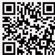
scan the QR code with your phone's camera to see the guides on our website