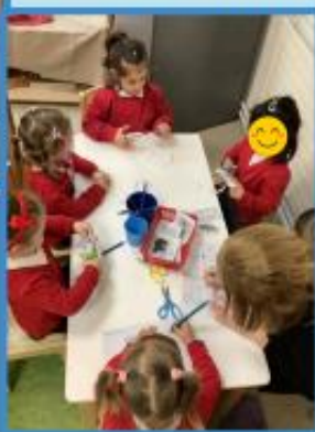
We have been working on our cutting skills.