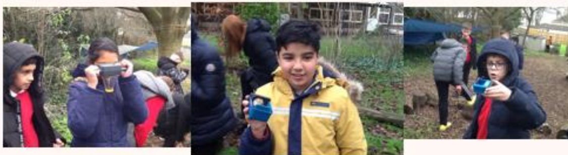
Children enjoying their observation skills and looking for invertebrates and vertebrates as part of our science lesson.