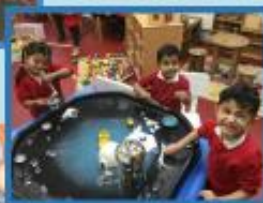
Water play learning about Winter