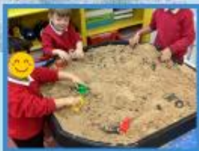
Alien fun!- We made aliens using salt dough and decorated them with lots of different elements including googly eyes and sticks.