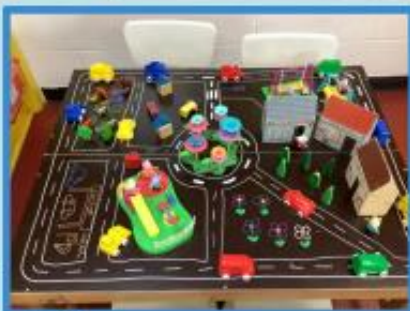
We enjoyed using our language to talk about where we would go on our journey around this map.