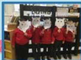
We loved learning about Chinese New Year