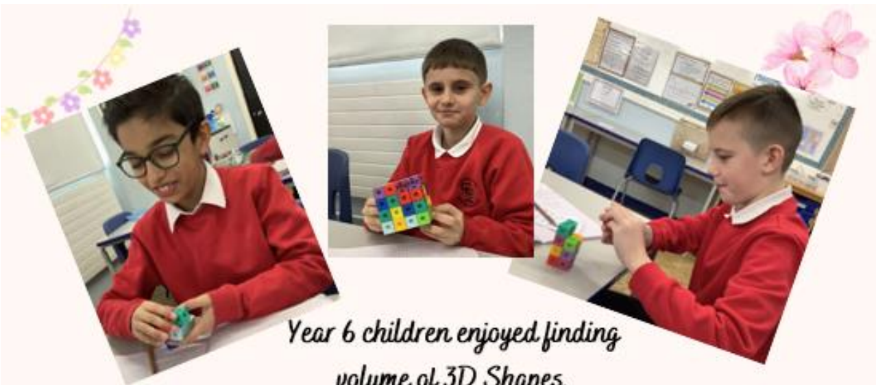
Year 6 children enjoyed finding volume of 3D Shapes.