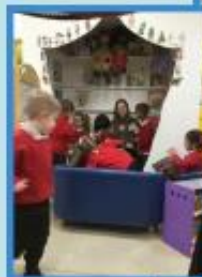
We love listening to stories