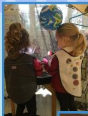
We loved the space role play area, making up stories and exploring the light toys.