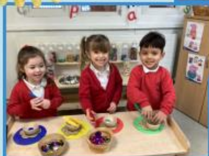
Our fingers were super strong when we sorted the coloured gems using the tweezers in preparation for writing in Reception.